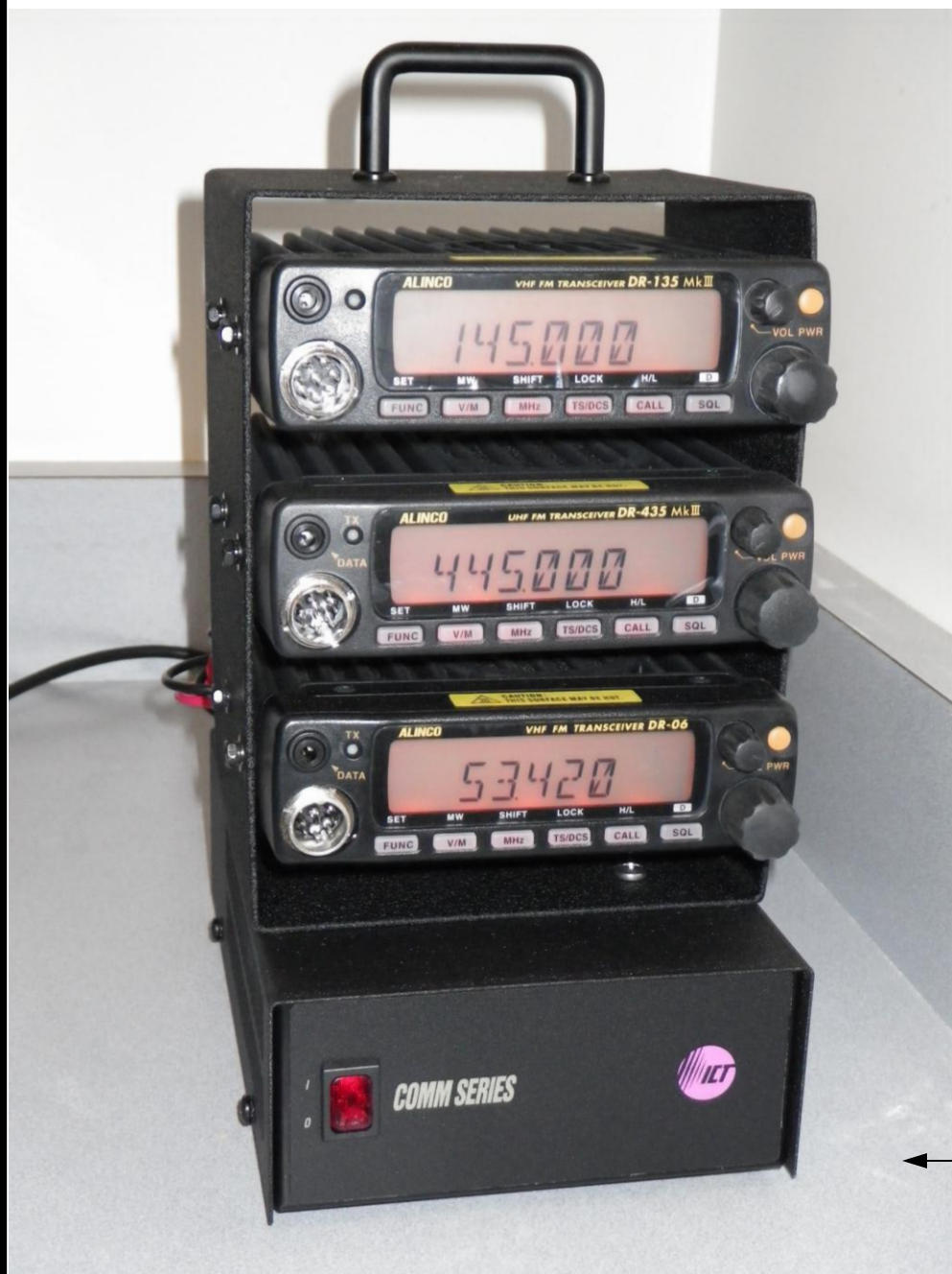
← Transportable Radio Package