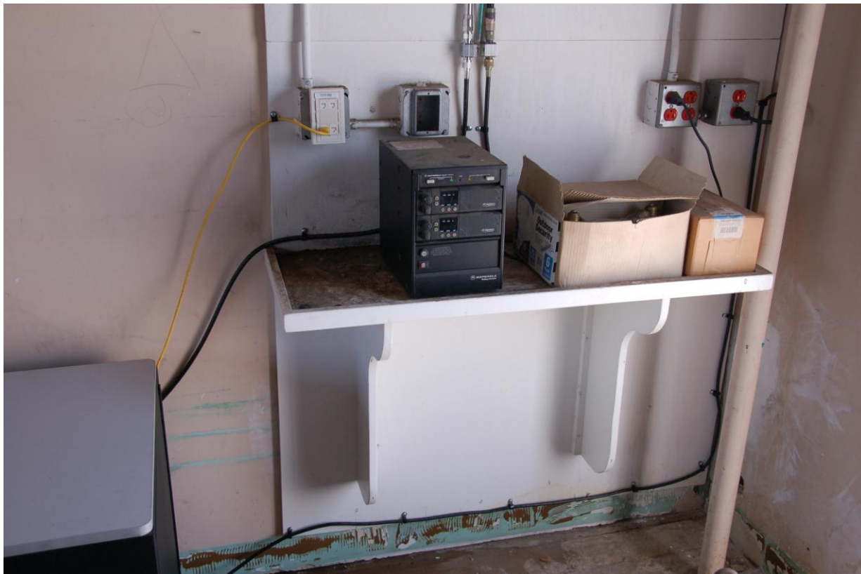
Connections to KPIT Network, Antenna, and A.C. (E-Power Outlet)