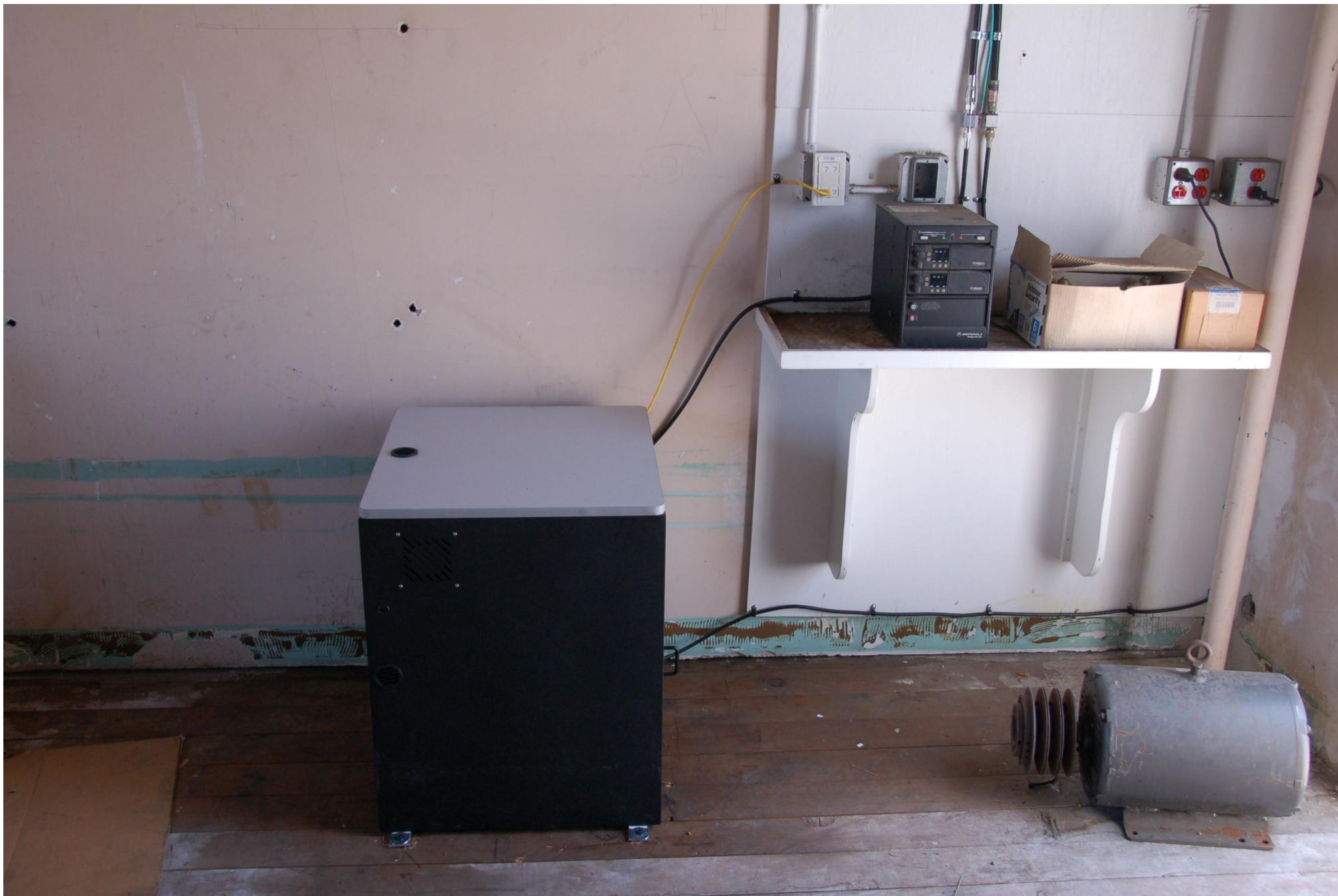
Side View of Cabinet Anchored to Wood Floor