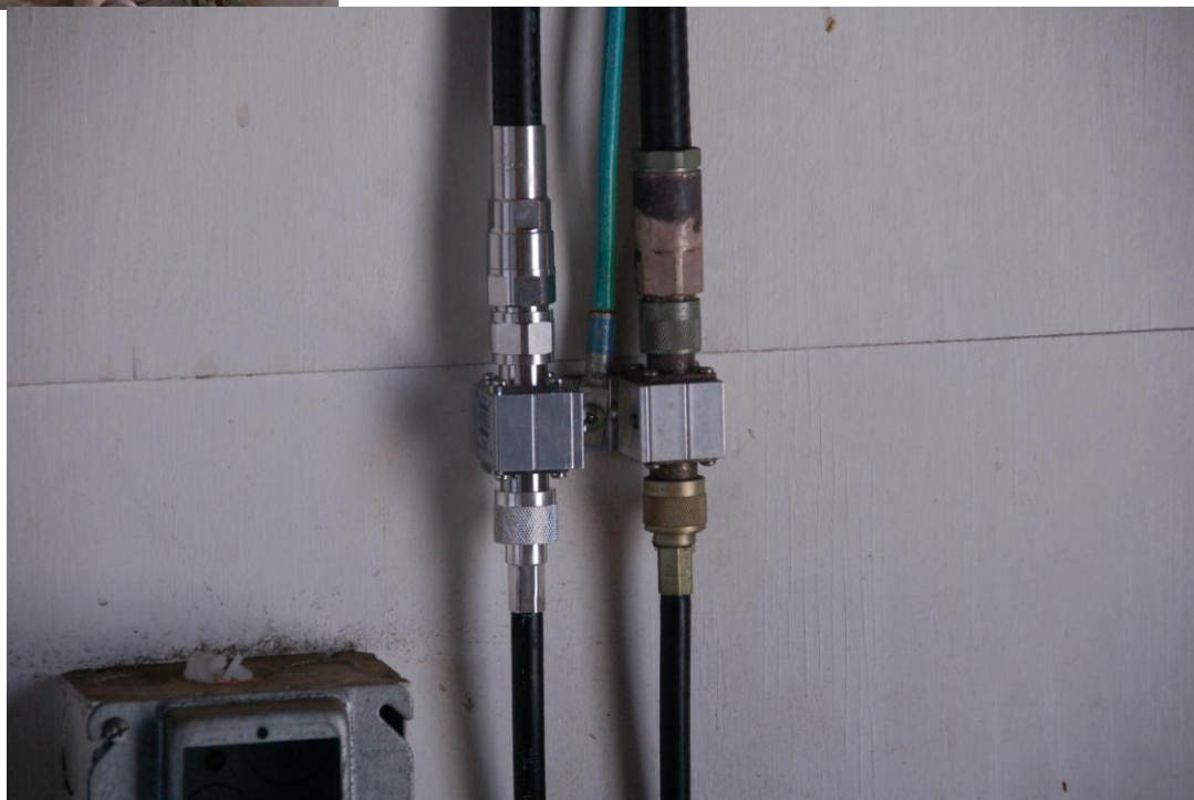
Antenna EMP Connection Detail