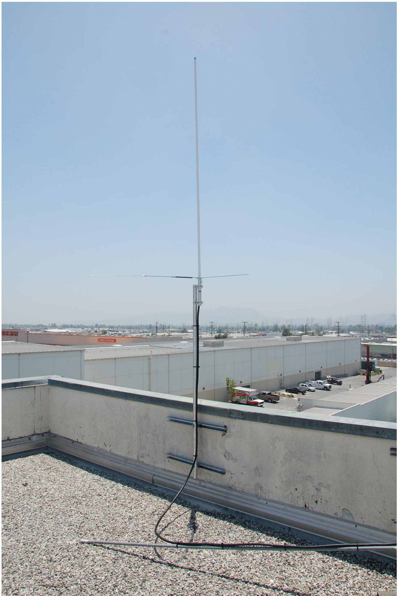
Roof Top Antenna